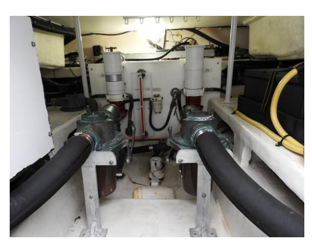
Sea Strainers & Day Tank Looking Aft