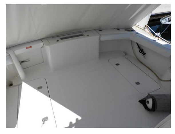
Cockpit, Transom Door & Bait tank