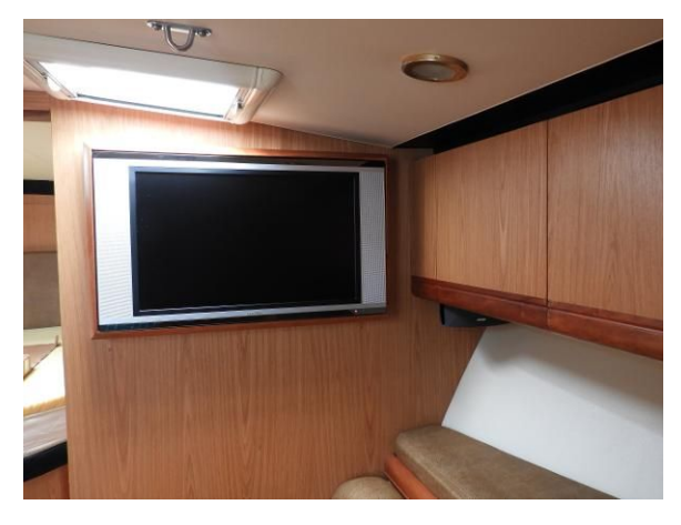
Flat Screen TV In Salon