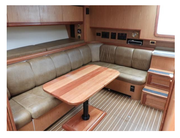
Convertible Seating to Two Single Bunks