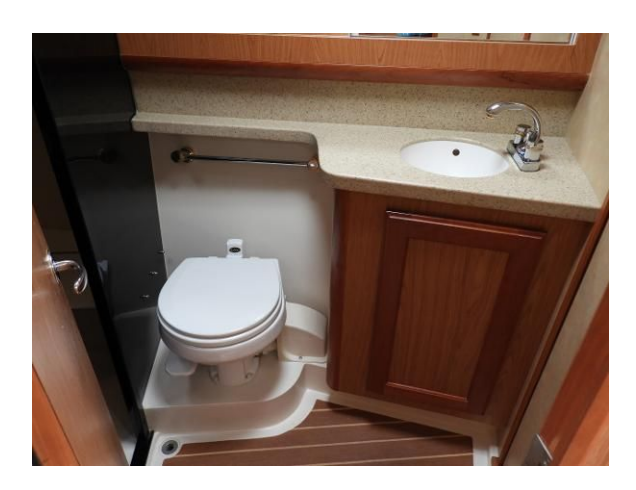
Vav-U-Flush Fresh Water Head