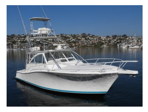
Luhrs 41 Open 2006