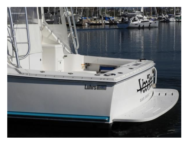
Cockpit, Swim Step & Transom