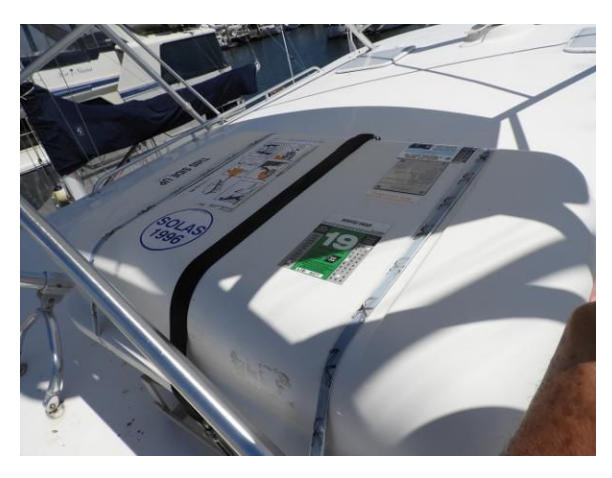
Elliot 8 Man Life Raft (Re Pack 2018)