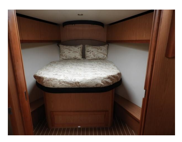
Master Queen Suite