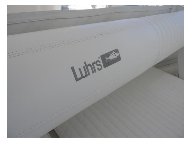
Helm Deck Seating Back Rest