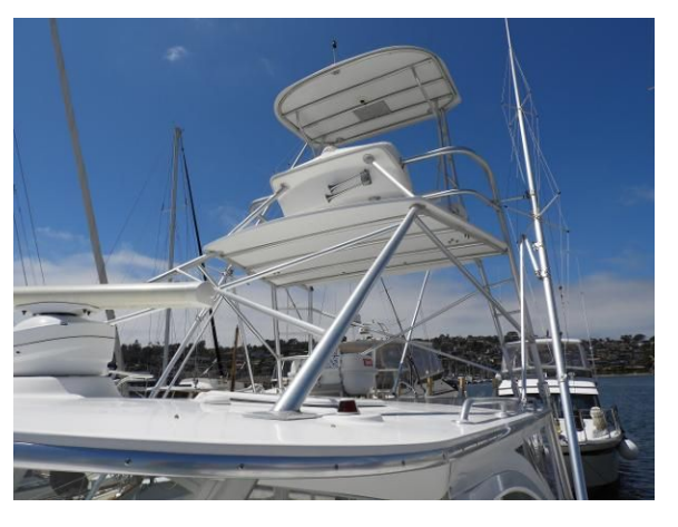
Tower & Upper Helm