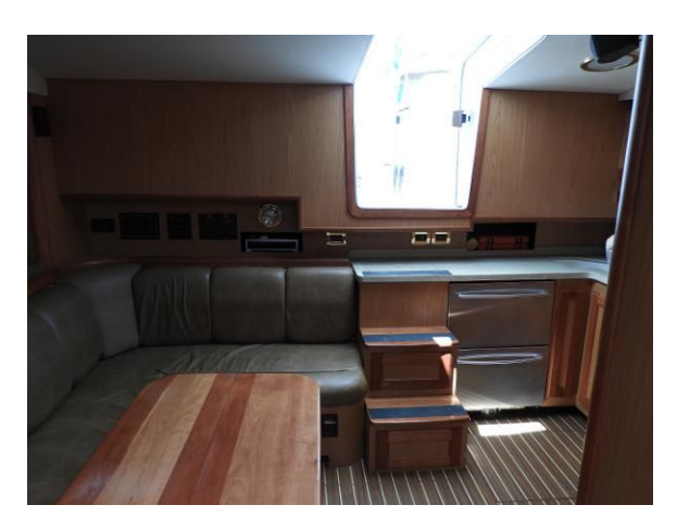
Salon & Entrance