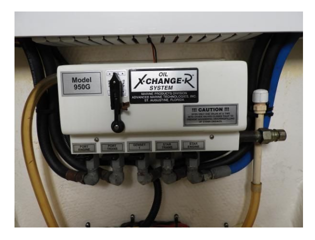
Oil change unit