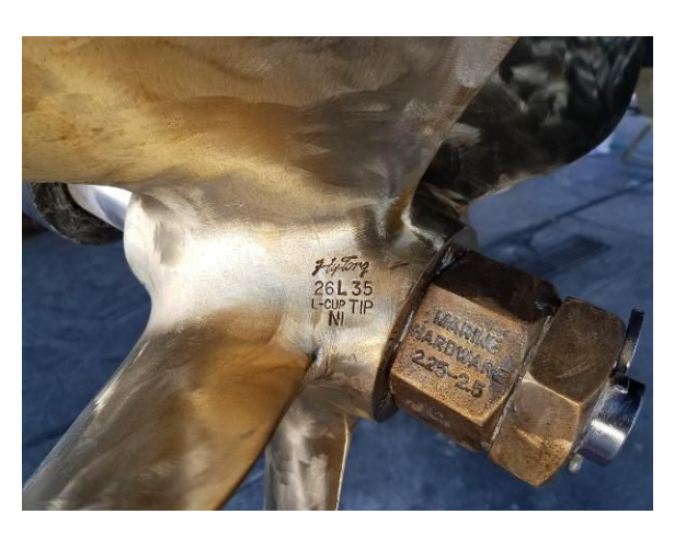
5 bladed props