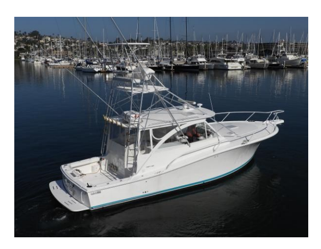
Stern with new swim step 2019