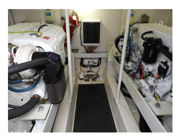
Engine Room looking Forward