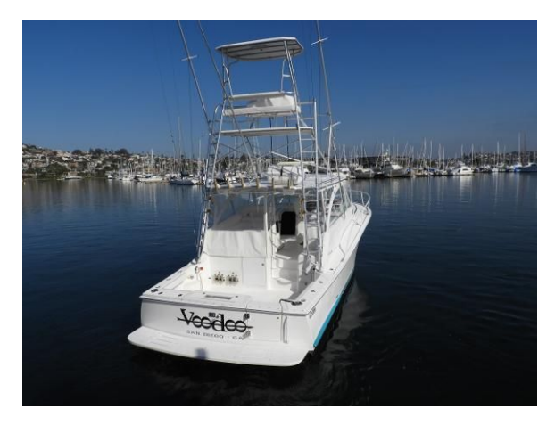
Stern with new swim step 2019