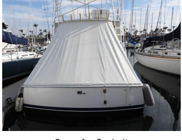
Cover for Cockpit