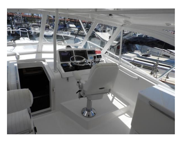
Helm & Cabin Entrance