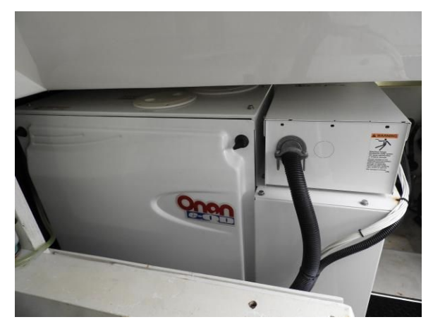
9.5 kw Onan Generator & Soundshield