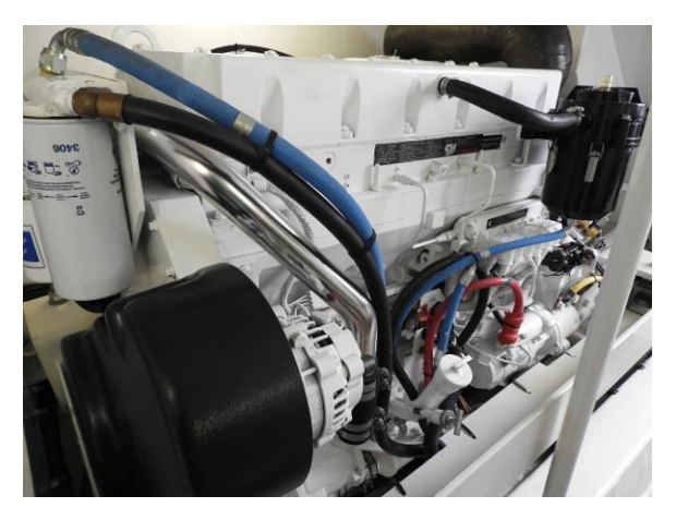
Forward Starboard Engine