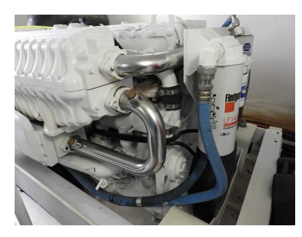
Forward Port Engine