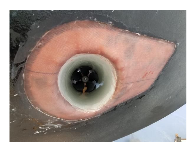
Installation of Bow Thruster 2019