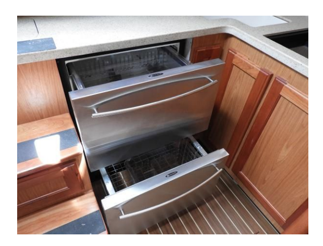
Duel Drawer Refrigerator & Freezer