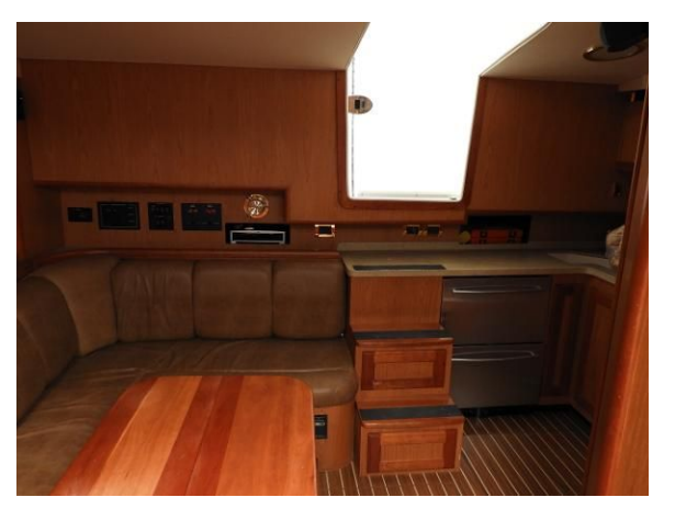
Salon & Entrance