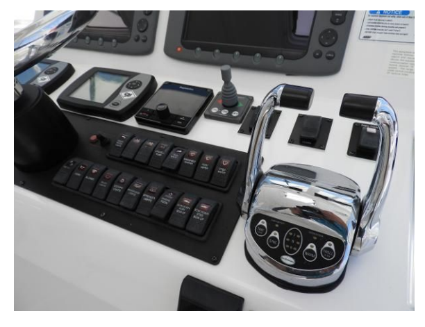
Glendenning Electronic Shifters