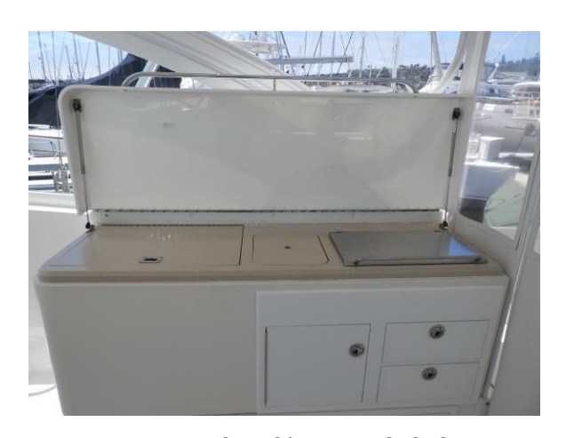
Helm Deck Refer, Sink, BBQ & Storage