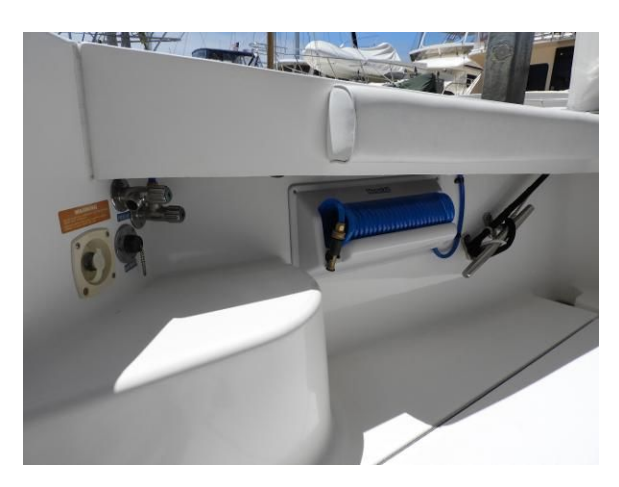
Cockpit Raw & Fresh Water Wash Down