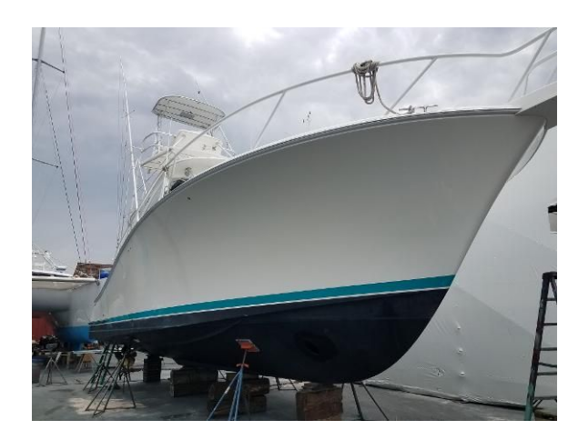
Bottom pic and Thruster 2019