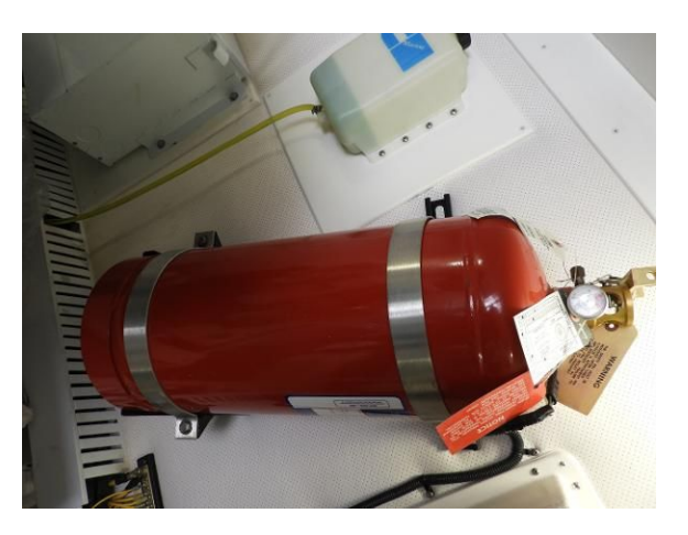
Fireboy Engine Room Suppression