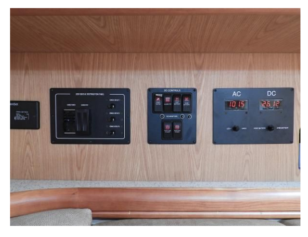
Inside DC Panel