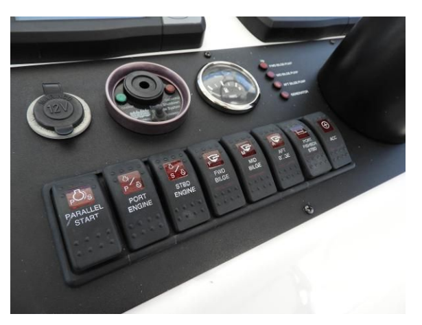
Helm Rocker Switches