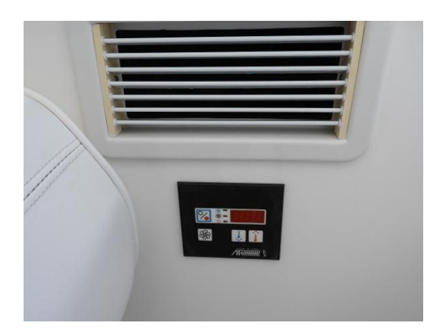
Helm Deck AC Unit