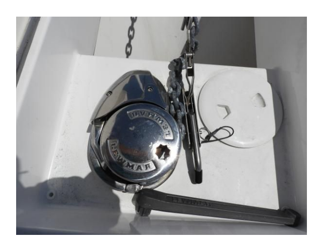
Lewmar Anchor Windlass