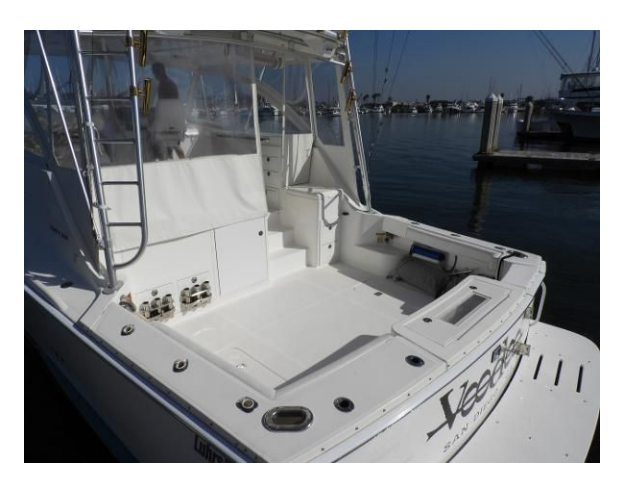
Cockpit & Wash Down